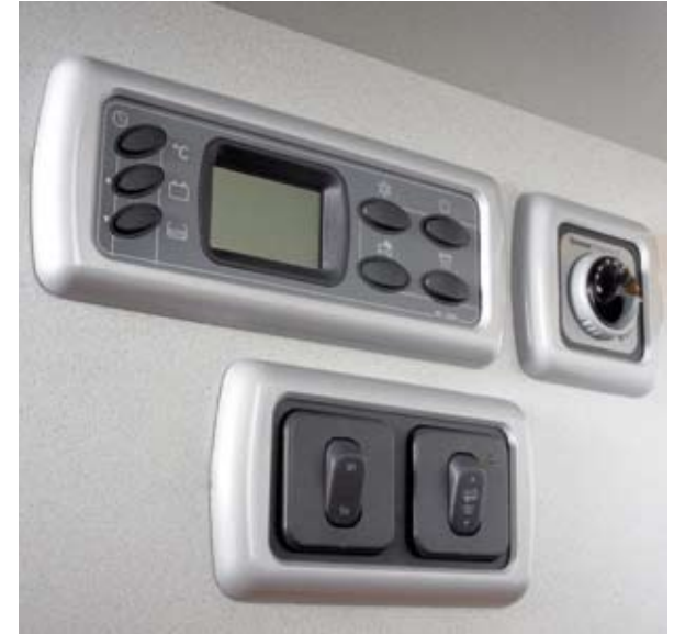
CONTROL PANEL WITH LIQUID CRYSTAL DISPLAY