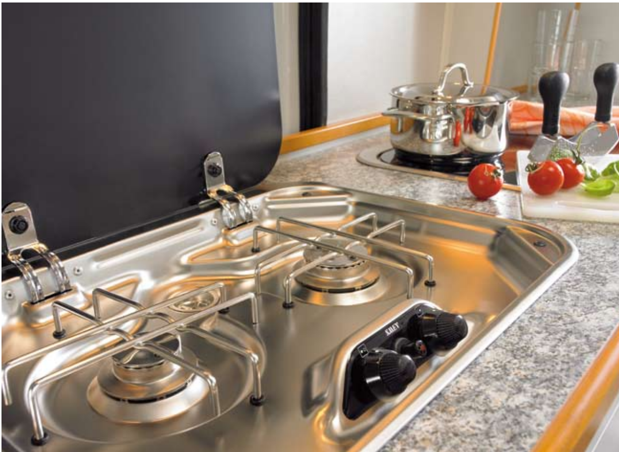
TWO-FLAME GAS HOB WITH GLASS COVER