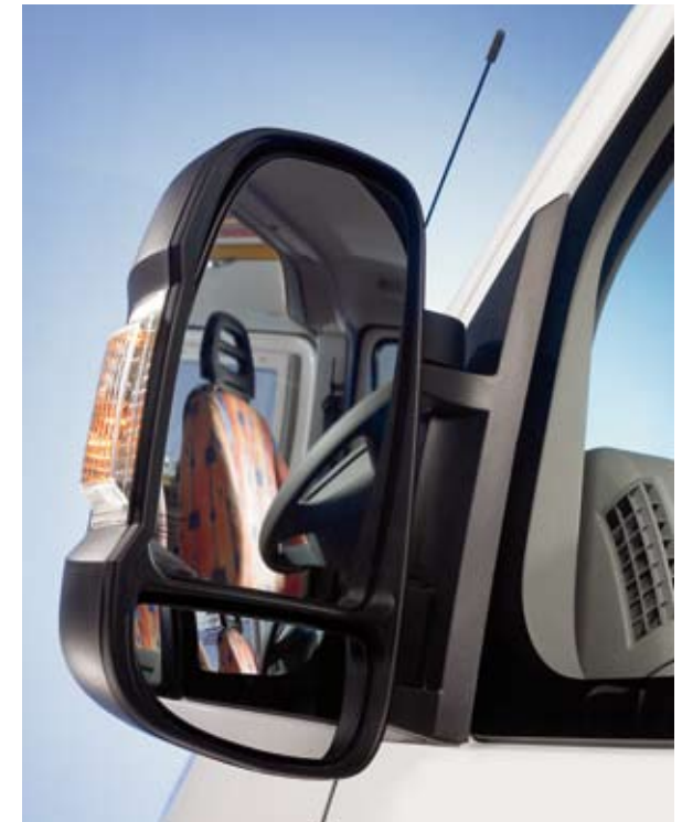
DOOR MIRROR WITH INTEGRATED DIRECTION INDICATOR

No compromises – that's the motto behind the Compact. Built onto the most successful basic vehicle of all time - the Fiat Ducato with 2.3-litre JTD engine and 120 HP (3.0 JTD/157 HP as an option), the Compact offers such technical highlights as anti-lock braking, traction control, six-speed transmission, a double-layer GRP hi-top roof and a 4 kW gas-powered fan heater. The Compact – uncompromisingly good.