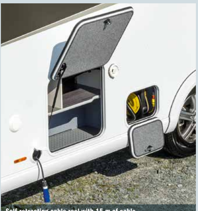
Self-retracting cable reel with 15 m of cable and central supply system