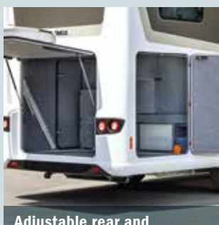
Adjustable rear and side flaps