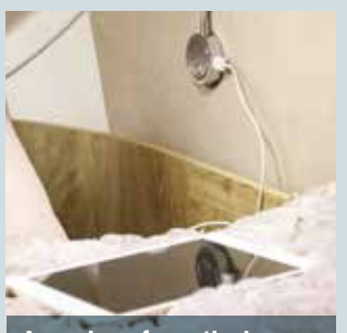
A number of practical USB sockets