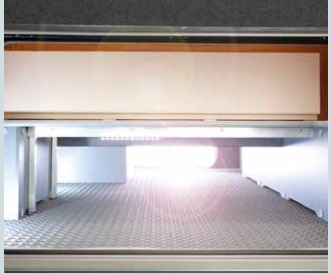
New: Power front darkening blind with privacy and sun visor function

Full-length, heated FRANKIA double floor