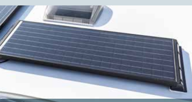
Environmentally friendly: Power from two solar panels