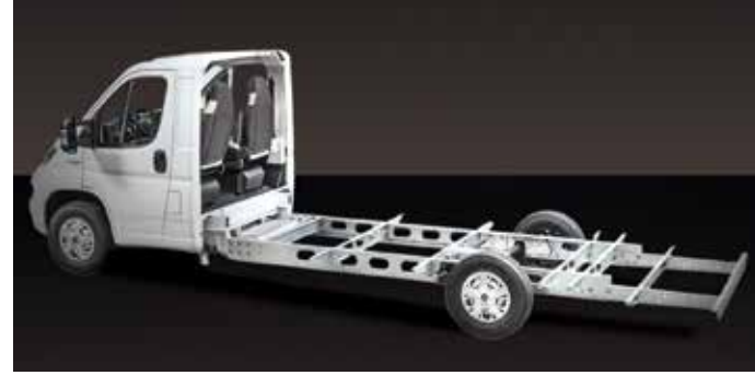
Now with noticeably more driving comfort: AL-KO low-frame with optimised roll stability, car-like suspension, improved handling and corrosion protection