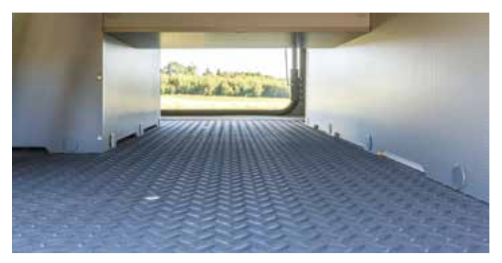
Space to the max: Unique double floor heated throughout with 35 cm of stepless height and load-through storage in nearly all models