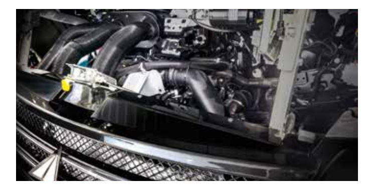
The latest generation of Fiat engines uses the more powerful and eco-friendlier drive technology according to the 6d-TEMP standard. Exceptional driving pleasure thanks to state-of-the-art assistance and infotainment systems