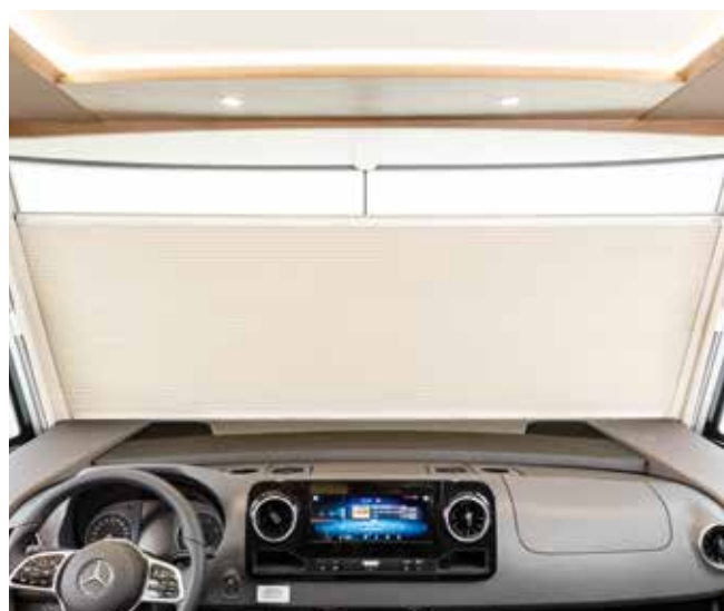
Power front darkening blind