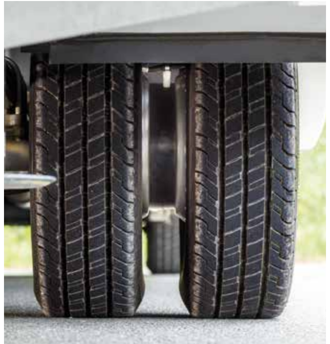
Wheel spacers (example)

Manual Thule 5.5 m awning; awning housing in anthracite