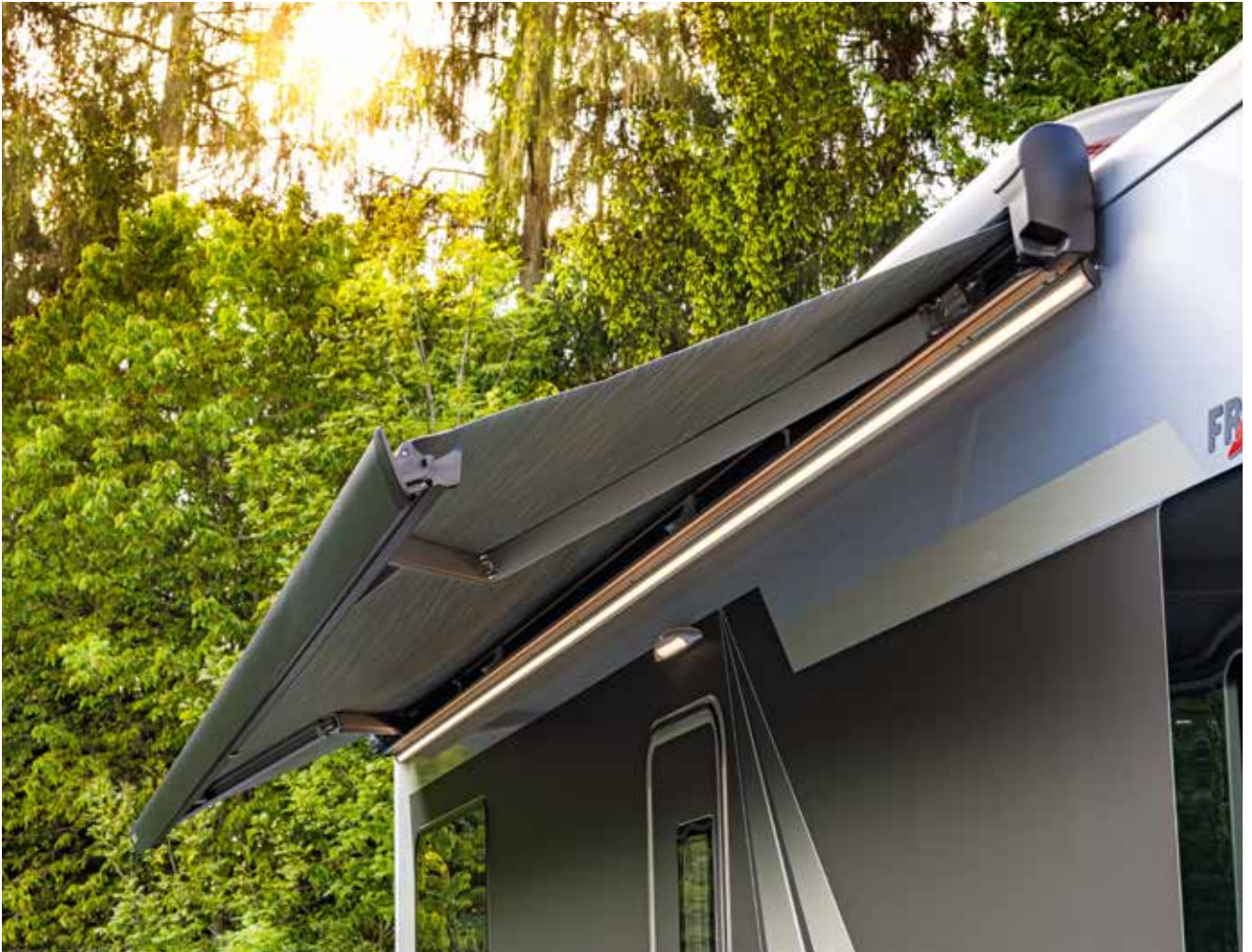
Awning – with optional integrated LED lighting profile (example)