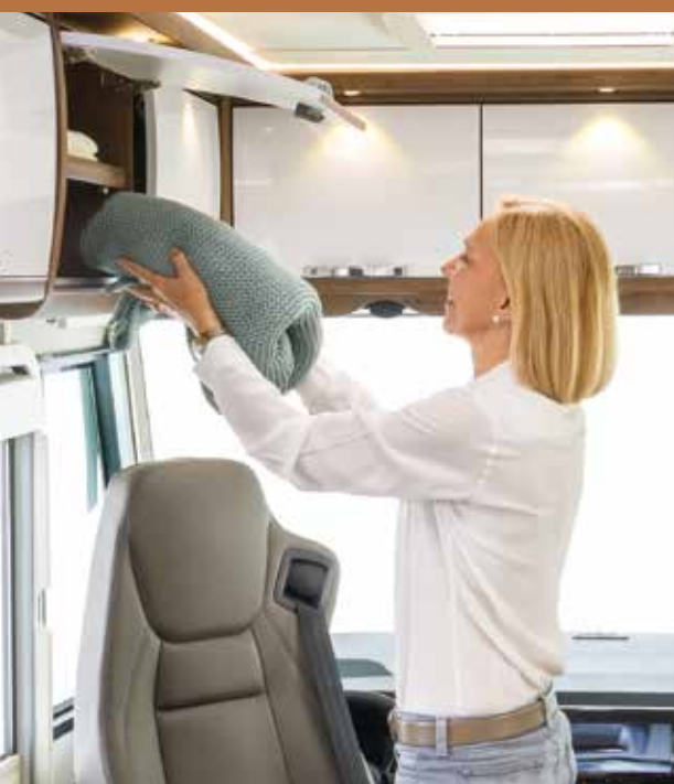
All kinds of places to store your items in the interior – and always within reach