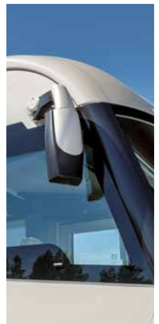
Double glazing cab windows