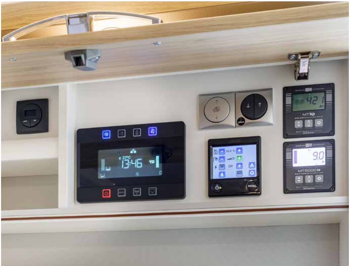
Central control: Easy to see and operate