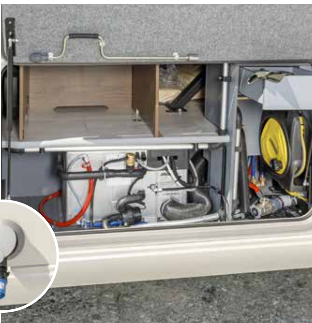
Self-retracting cable reel with 15 m of cable and central supply system