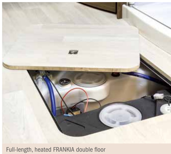
Full-length, heated FRANKIA double floor