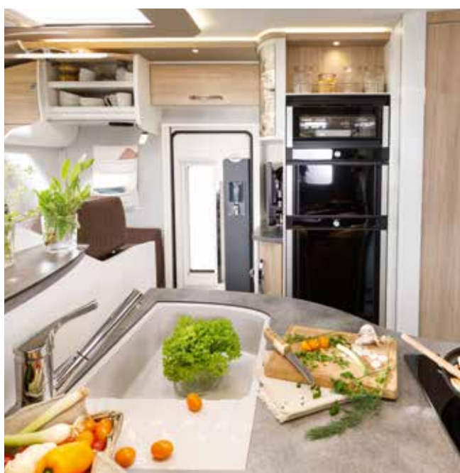
Uniquely functional modular kitchen featuring a high-end HPL worktop – the FRANKIA MaxiFlex kitchen