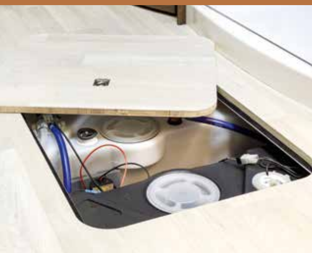
Completely stepless FRANKIA double floor accessible from inside and outside