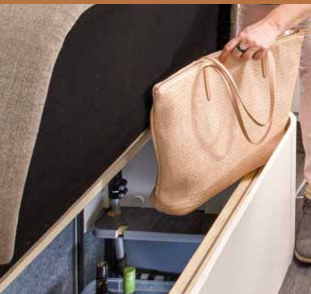
Access the storage space in the seating group with one hand