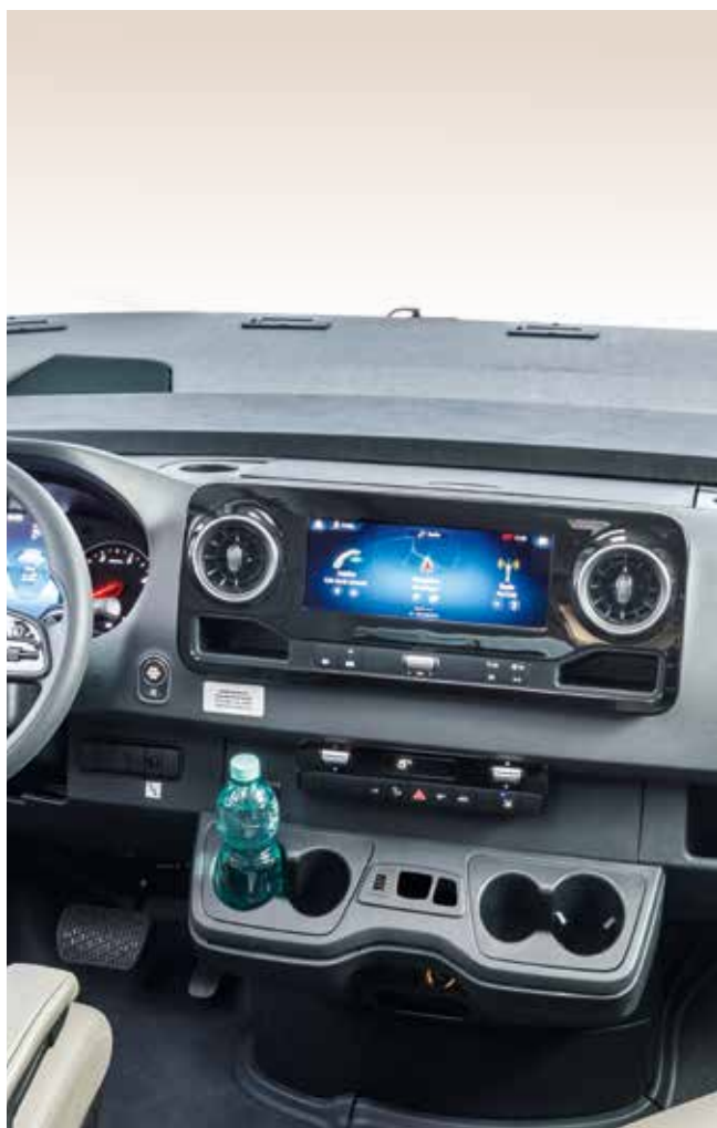
Next-generation infotainment: MBUX*