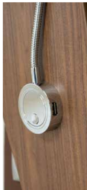
A number of practical USB sockets