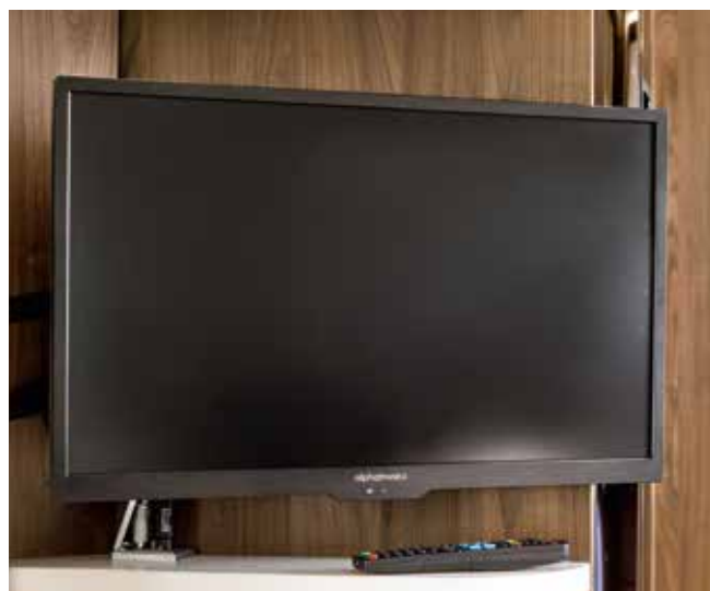
Alphatronics SL 24 inch flat screen