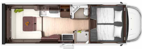
PALACE A 80 RL