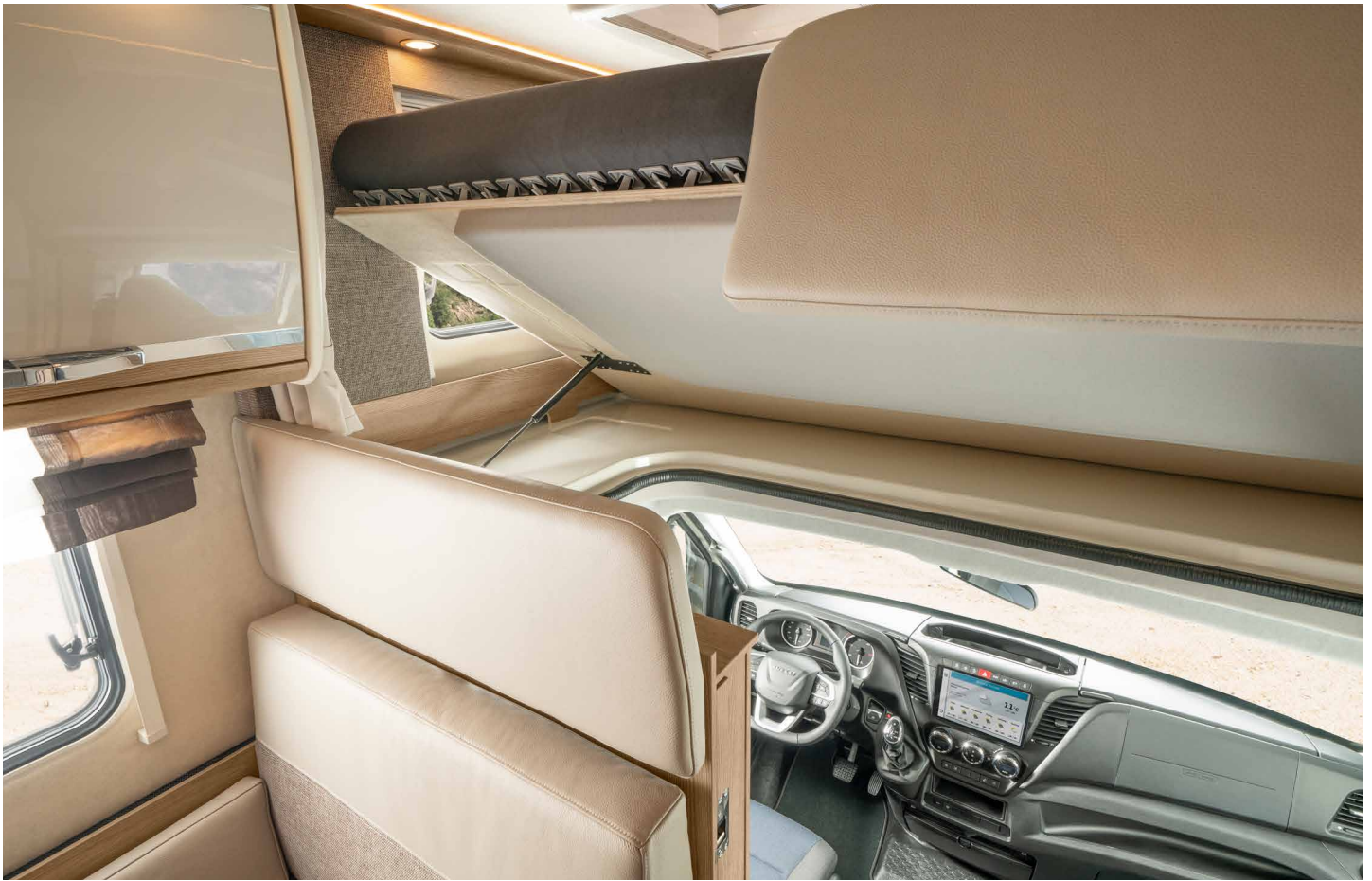
Comfortable access to the cockpit