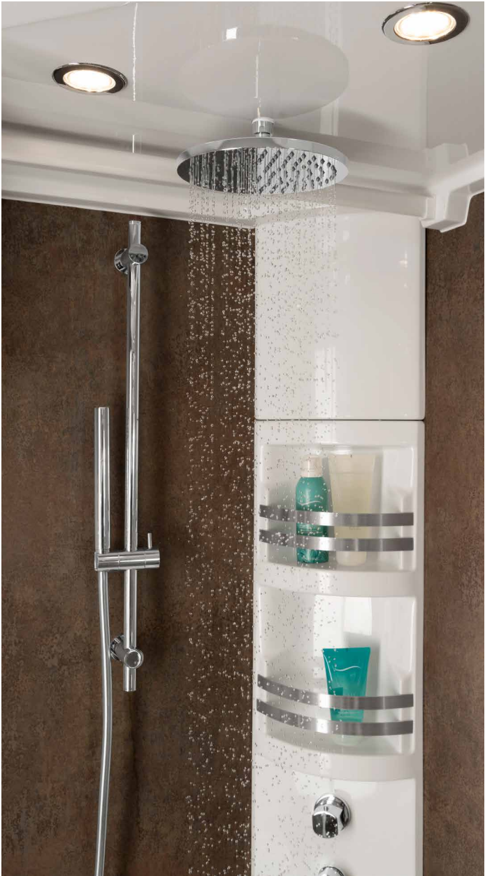
Rain shower (optional)

Prices in Euro (incl. 20% VAT) 1) weight in kg