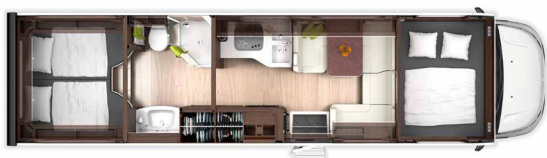
PALACE A 94 L