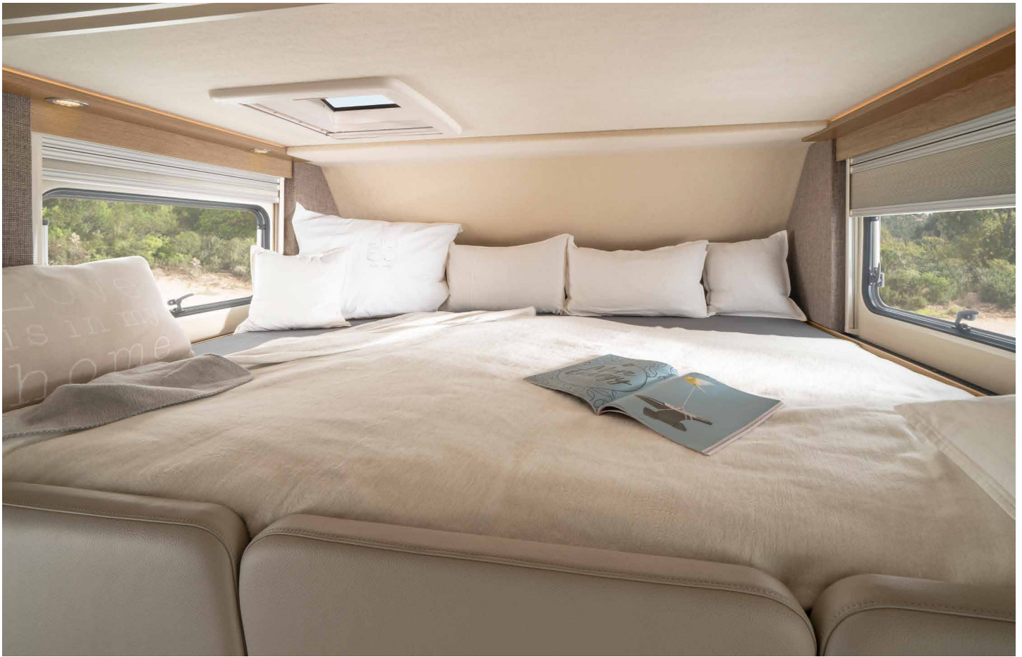
Alcove bed from PALACE A 94L