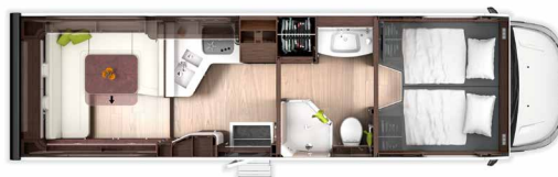
PALACE A 88 DL