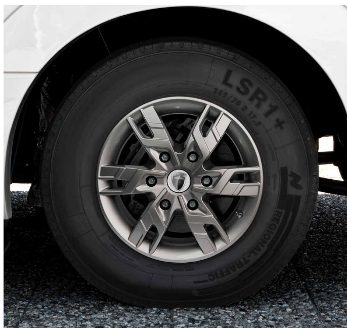
Light metal rims MORELO Graphite