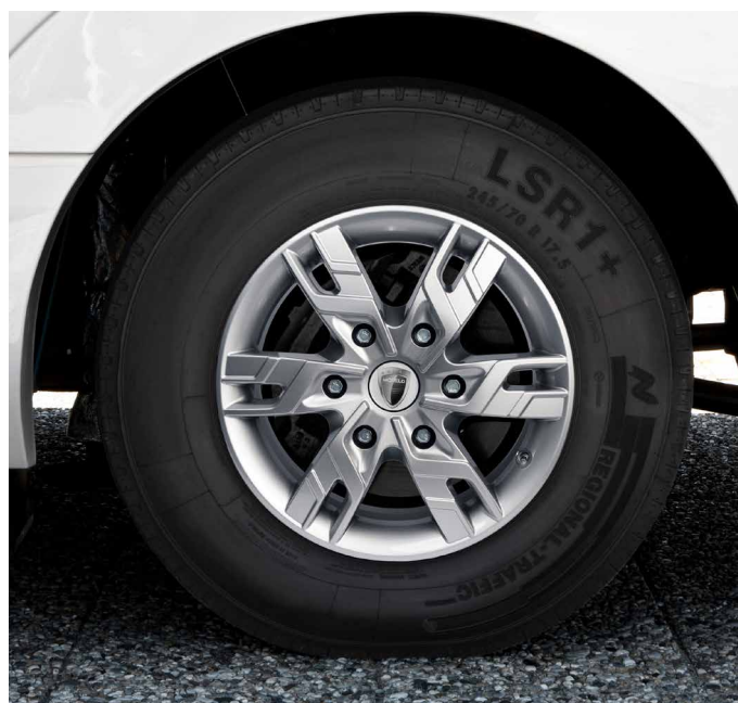
Light metal rims MORELO Silver