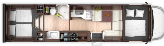
PALACE A 98 LS