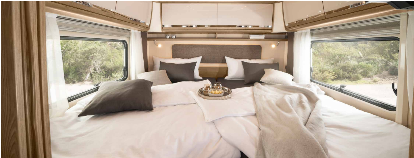
Beds with multi-zone mattress, including comfort slat base and adjustable headboard