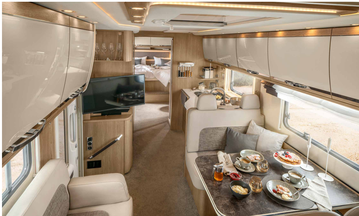
PALACE ALKOVEN Living space