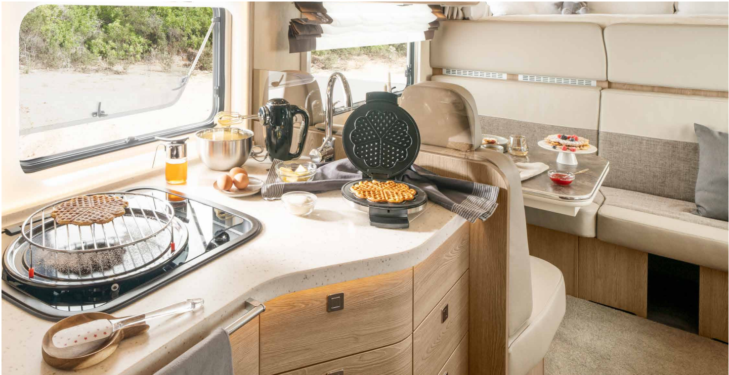
Kitchen from PALACE A 94 L