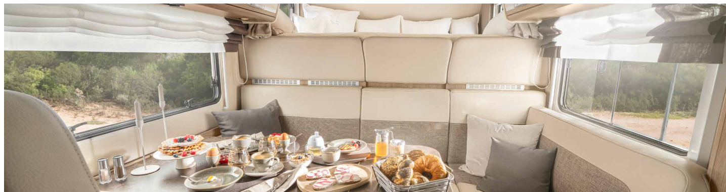
Interior from PALACE A 94 L