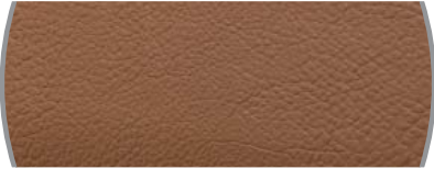
‘Roma’ faux leather trims.