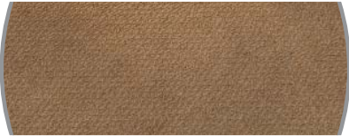
Domestic heavy duty removable carpet in a contrasting stone colour.