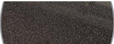
Polished ‘Corian’ effect work surfaces.