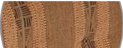
Luxury cross weave ‘Belgravia’ upholstery.

Important When adding extra equipment, it is important that individual axle loading weights or the Maximum Authorised Weight is not exceeded. This would not only automatically invalidate any warranties, but also it could affect your safety and the handling of the vehicle. An overloaded vehicle could lead to prosecution. If you are unclear or need any further guidance as to any of the technical aspects in the operation and driving of your new Auto-Trail motorhome, please consult your supplying dealer prior to driving your vehicle on the public highway.